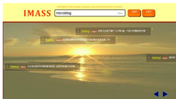
Figure 3. The IMASS interface

In this section, we show some snapshots of our summarization system with real examples using Plurk dataset. Our demo system is designed as a